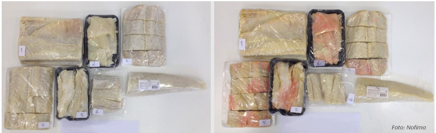
Storage at 4 °C (left) gives a shelf life of a minimum of 2 years. In the case of storage at elevated temperatures (e.g., 25, 30, or 35 °C (right), a red discoloration may appear due to the growth of halophiles.

The shelf life of saltfish and clipfish is influenced by storage conditions such as temperature, relative humidity, and packaging. Also, the water content and the initial level of halophilic microorganisms of the fish influence its shelf life.