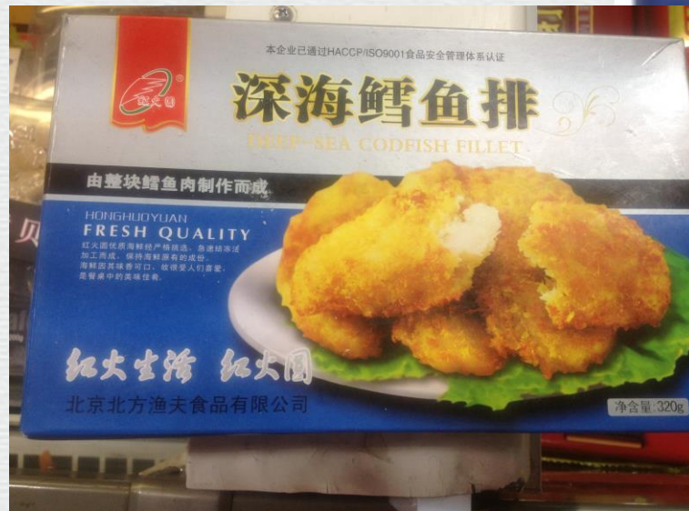
Alas kapollack 300g Online: 26.8yuan Supermarket: 29yuan