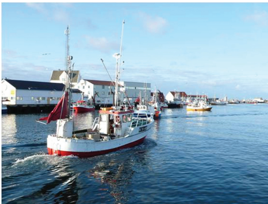
Implementation of traceability at the line level is challenging for wild-caught fish as there is less control over quantity of fish landed, variation in quality etc.

Communicating and understanding the benefits of a traceability system is important for successful implementation of traceability. If a company cannot identify any benefits in carrying out an implementation, the motivation will soon wane. This will affect the willingness to invest in any technology needed to achieve better documentation of products. Take, for instance, the following scenario: a production plant distributes its fish to a wholesaler who, in turn, distributes the fish to a supermarket. The supermarket is extremely keen to offer its customers more detailed information about the